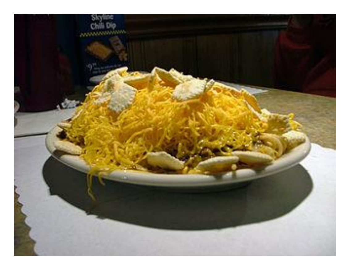
Four Way with Oyster Crackers