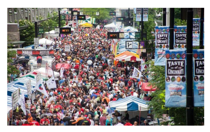
Taste of Cincinnati

The Belle of Louisville docks next to the Natchez in Cincinnati for Tall Stacks 2006 By Bryce Mullet